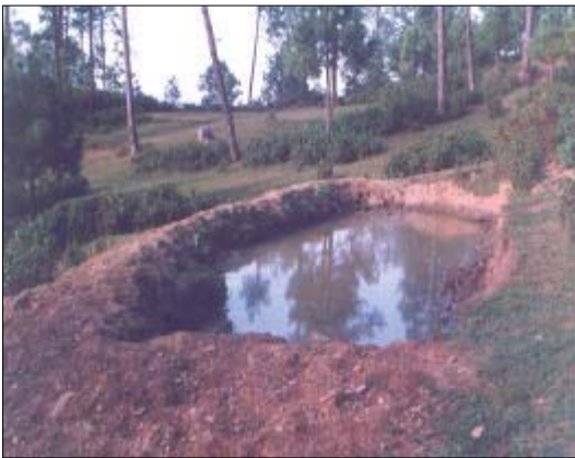
Fig. 2: Development of chaals/ponds