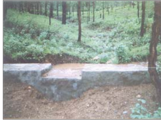
Fig. 3: Recharge structures