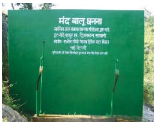
Fig. 5: Slow sand filter