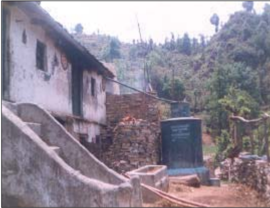
Fig. 1: Rooftop rainwater harvesting