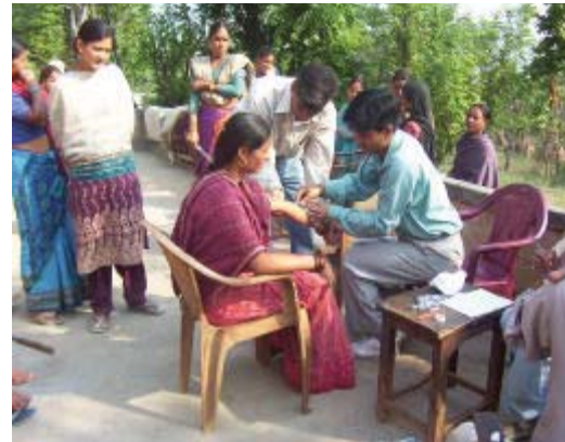
Fig. 4: Health survey

toilet flushing etc. Additionally, if the water is properly treated, it can be used for human consumption. Rainwater harvesting helps us to retain the rainwater to recharge the groundwater resources [5, 6]. Various rainwater structures like roof top rainwater harvesting structures, percolation pits and bunds, development of chaals etc. were prepared in the study area (Fig. 1-3). Chlorination pots were recommended in the roof top rainwater harvesting structures for disinfection of harvested water for drinking purpose. Water filtration units were installed at the top of roof water harvesting tanks for the removal of roof dust coming into tanks with roof top water. The filter units comprised of gravels and graded sands. Chlorination pots have been suggested for rainwater harvesting tanks for disinfection of water and safe water supply for drinking purpose.